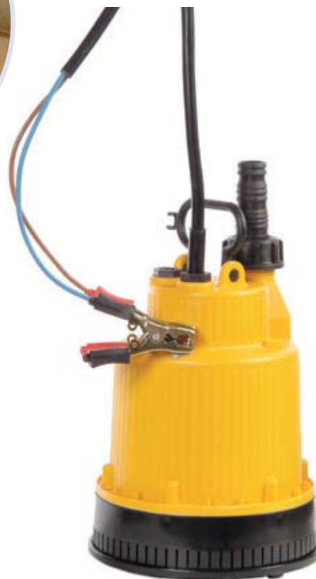
Baby Battery manual