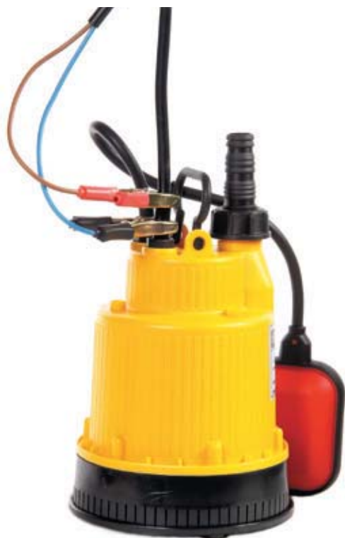
Baby Battery auto